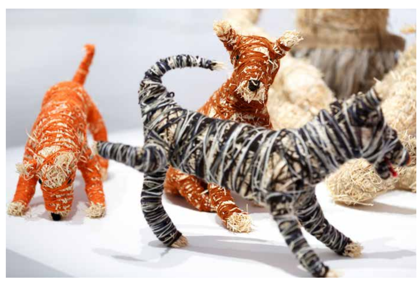
Bronwyn Razem, Camp Dogs 2017 (detail), in the Koorie Art Show 2017