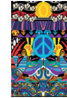
vert2 digital print on aluminium 70 x 47 cm $4,000