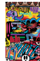
coplex digital print on aluminium 77 x 50 cm $4,300