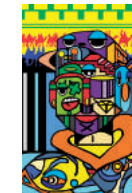
FROG digital print on aluminium 150 x 100 cm $7,000