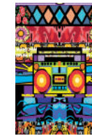
vert3 digital print on aluminium 70 x 47 cm $4,000