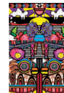
3d digital print on aluminium 70 x 47 cm $4,000