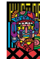
KING digital print on aluminium 150 x 100 cm $7,000