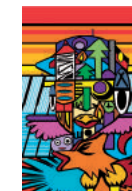
NOOM digital print on aluminium 150 x 100 cm $7,000