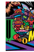
MOOB digital print on aluminium 150 x 100 cm $7,000