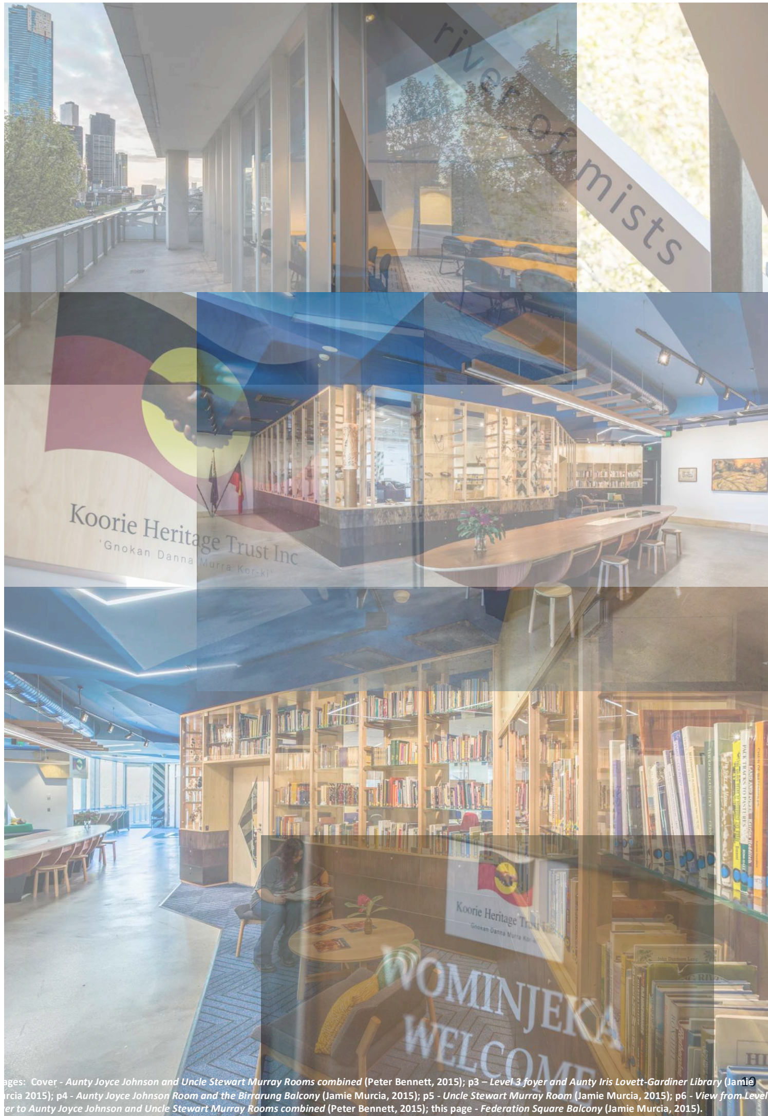
Images: Cover - Aunty Joyce Johnson and Uncle Stewart Murray Rooms combined ; p3 – Level 3 foyer and Aunty Iris Lovett-Gardiner Library ; p4 - Aunty Joyce Johnson Room and the Birrarung Balcony ; p5 - Uncle Stewart Murray Room ; p6 - View from Level 3 to Aunty Joyce Johnson and Uncle Stewart Murray Rooms combined ; this page - Federation Square Balcony.